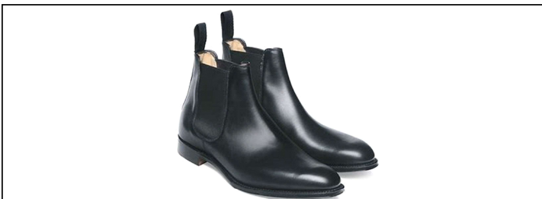
Fig. 4 : Chelsa boots

In the 19 th century boots originated in Chelsa, England. The designer for Queen Victoria, designed a unique footwear for the Queen that later became very fashionable among the peers and public. This style of shoe ends at the ankle. Iconic feature is the elastic in the shoe that makes it easy to insert and remove the leg. The loop in the backside of the shoe was also an appreciative design, that was designed for the same purpose of ease in comfort [6].