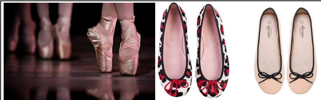
Fig. 5: Ballerina