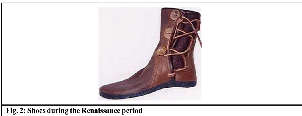
Fig. 2: Shoes during the Renaissance period

In the middle ages all class of people started wearing slippers. In the 15 th century men started wearing heels. It was strange to imagine that the fashion of wearing heels, the very popular feminine accessory was actually invented and used by men. The purpose was to increase the height of the soldier in the war ground, so that he can see the enemies far behind and fight more effectively. Later men started popularising heels to increase their height in comparison to their female counterparts to portray a sign of a higher level enduring more protection and safety envisioned through their tall look. Human feet is different in the left and right. It was also strange to know that for a very long time (till 19 th century) there were no separate right and left shoes. One shoe for both feet only was made in the mass production. To accommodate both legs the shoes were designed narrow. Consumer should buy the shoe, walk with it and then get the shoe modified to fit the foot properly [3-4].