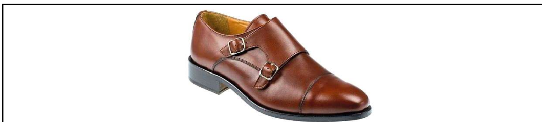
Fig. 15 : Monks

These are shoes with low cut vamp. Buckle and strap are the common feature in monks. The common example is school shoes.