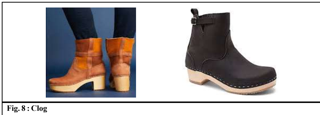
Fig. 8 : Clog

The working-class people, mine workers and farmers need a special kind of boots that will be strong and stand the wear and tear of harsh conditions. The important function is here is to protect the wearers foot. Wood is the chosen material to make these shoes. The sole is made of wood and the top foot covering is made of leather. Slip on clogs are made using elastic on the sides to enable easy wearing [11].