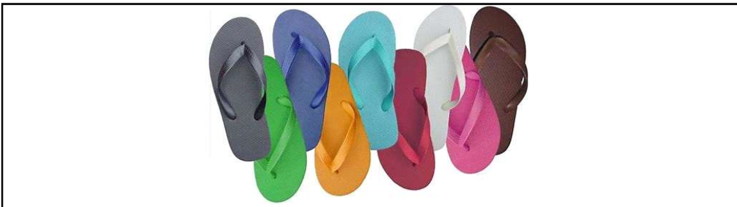
Fig. 14 : Flip flop

The Hawaii slipper is flat and available in variety of designs and colours. The name flip flop is derived from sound it creates while walking. The V strap pass between thumb and toe. Leather, plastic and rubber are the common raw materials used in making these shoes. In Australia these are called thongs, Jandals in New Zealand and Slippers in Hawaii islands. Flip flop is both fashionable and comfortable., commonly referred as poor man’s footwear [14-16].