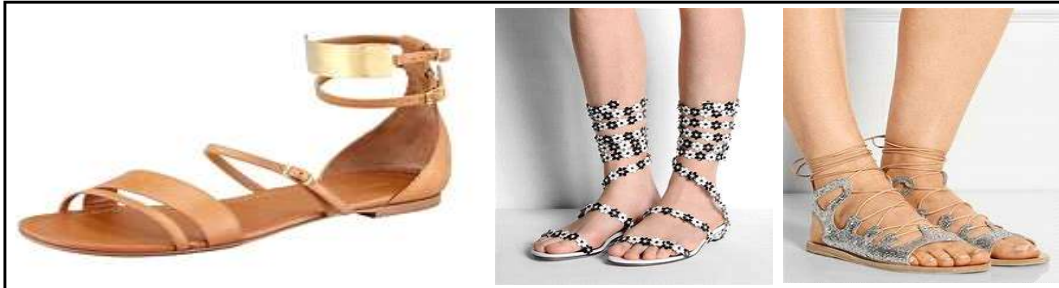
Fig. 13 : Sandals