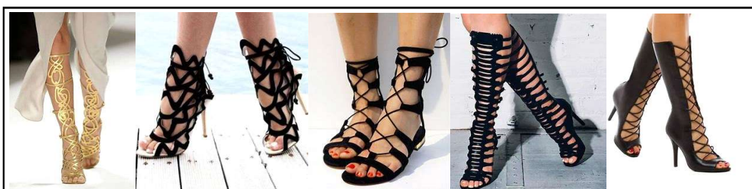
Fig. 3 : Gladiators

It would be fascinating that the style of footwear once used by the Greek soldiers have now become a major trend in women's footwear category. Gladiators have a very simple design of a flat base and long rope that is tied around the calf. The semi-exposure of the foot makes it extremely glamorous. In the recent times, pointed heels along with cut work fabric, braided strings, tassels and bon-bons are used in order to make the gladiators more elegant.