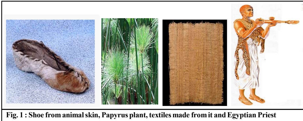
Fig. 1 : Shoe from animal skin, Papyrus plant, textiles made from it and Egyptian Priest

It is believed that 40,000 years ago footwear was made from animal skins and wood. Ten thousand years before the term ‘sandals’ was framed that was used both in winter and summer. It was noted that the most beautiful slippers were made by the Egyptians using the Palm and Papyrus leaves. It was said to be one of the significant accessory used by the Egyptian priests (Fig. 1).