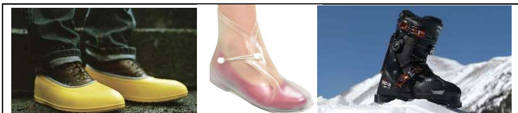
Fig. 7: Galoshes and Ski boots

Boots are usually made from a single piece of leather or rubber. The boots used by American cow boy is usually heeled, that is strong to kick the horse and initiate the riding. No trims like laces are seen in this style. These are also called as the cowboy or riding boots. Galoshes are boots that are made from plastic or a water-resistant material, that is worn over a shoe to prevent the footwear worn inside.