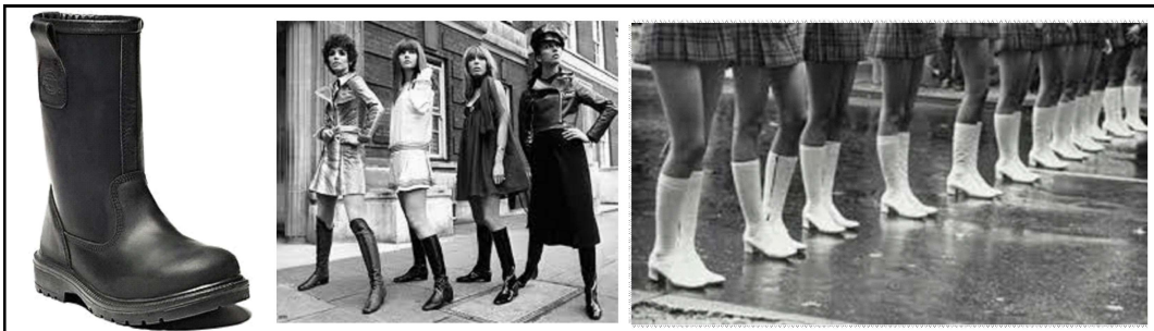
Fig. 6: Boots

Shoes normal have holes (lace hole) and covers the base of foot. The dust, dirt and soggy water walk will be impossible. Thus footwear styles that covers the foot completely till the ankle and sometimes even up till knees was essential. Boots got a recognition here. The fashionable look with boot can be viewed through the iconic cow-boy Americans look. One can observe the nature of activity among muddy waters and desert ride and the role of boots. The variation of these boots is available with the covering extended till the hip. Another look adopted is women wearing mini-skirts and boots. Difference in heel size, material used and styles in opening the boots are seen as part of boots fashion [6].