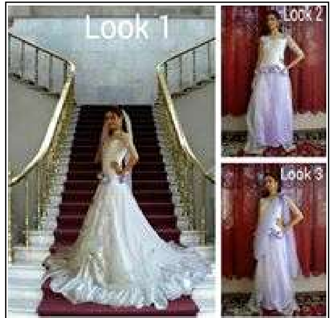
Fig. 4 : Gown Set 3: Trumpet style gown + Sheath gown + Saree gown