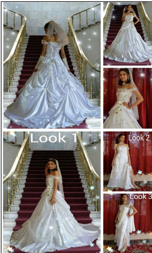
Fig. 3 : Gown Set 2: Ball style gown + Sheath gown + Saree gown