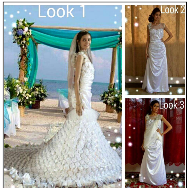
Fig. 5 : Gown Set 4: Mermaid style gown + Sheath gown + Saree gown